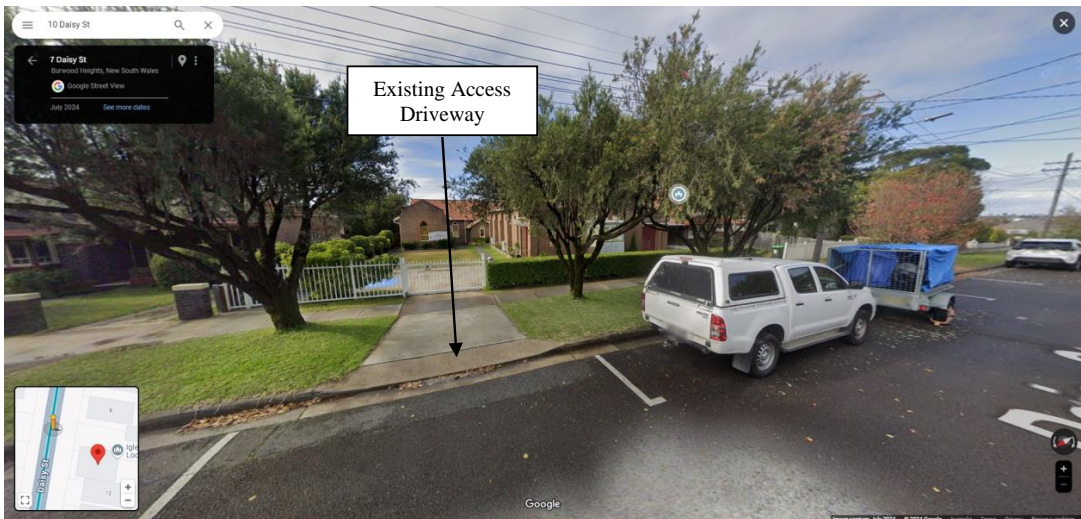
View of the existing access driveway off Daisy Street