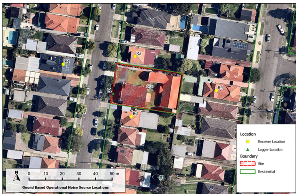
Figure 1: Proposed Development Site with Nearest Residential Receivers