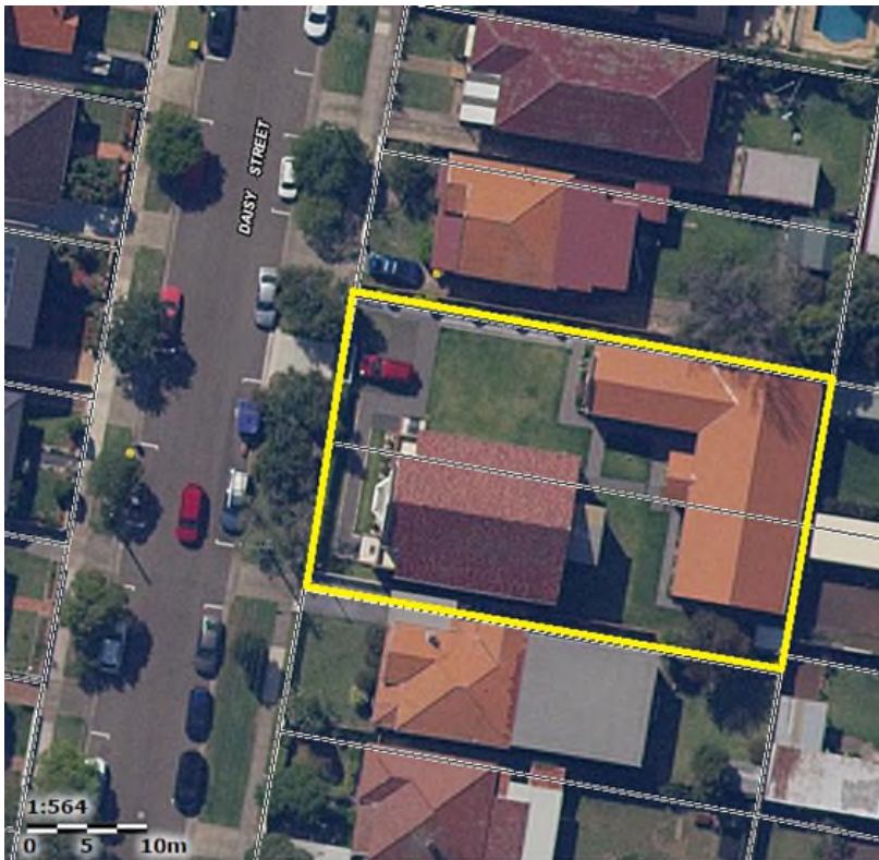
Figure 1: Aerial view of the site at 10 Daisy Street